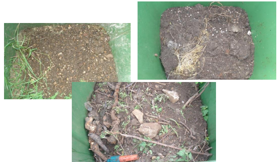
Unacceptable amount of soil

A large amount of turf is also unacceptable. If there are a few offcuts and the bin isn't too heavy to move, the bin can be collected