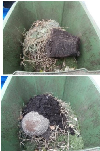
Acceptable amounts of soil

The images should give you a guide to how much soil is acceptable.